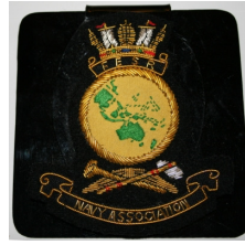
Pocket PVC mount