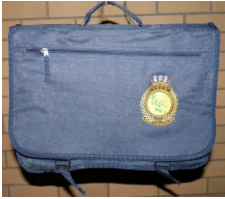
Bag - $12

Item 1: – Multi-purpose, multi pocketed bag. Great for carrying the Notebook Computer, Stationery, Pens, USB devices etc. Strong, light and durable long lasting woven material. The pocket for the Computer is padded for extra protection. Anniversary logo embroidered.