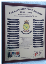
Honour Board $90-00

Item 8: - Medallion commemorating RAN Centenary (1911 – 2011).