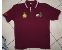
Polo Shirt - $20

Item 2: - Embroidered polo shirt. Navy badge and FESR 55th Anniversary Crest. No small or medium available.